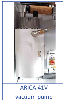
ARICA 41V vacuum pump