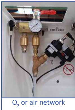
O 2 or air network