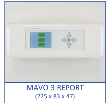
MAVO 3 REPORT (225 x 83 x 47)