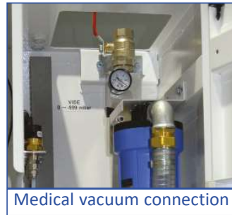
Medical vacuum connection